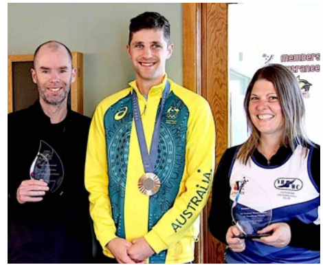
Masters M40+ Men & Women