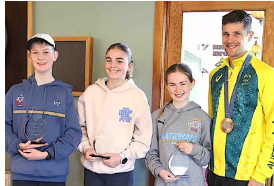
U14 Boys & Girls