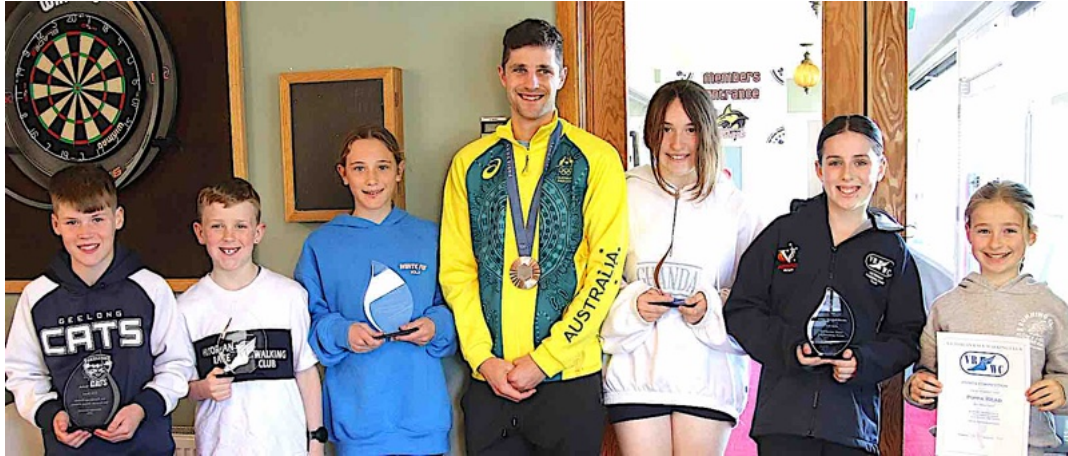
U12 Boys & Girls