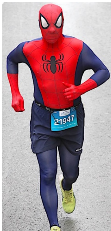
Clue: He’s a Centurion.