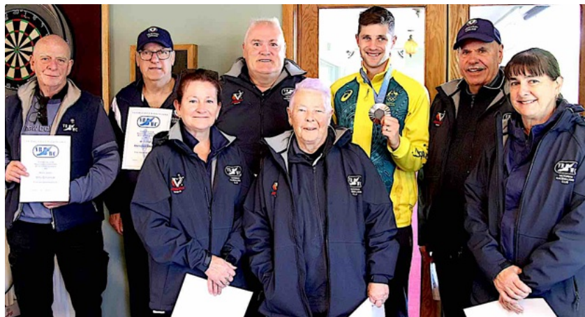
VRWC walk judges