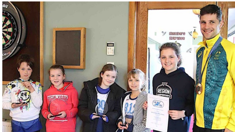
U10 Boys & Girls