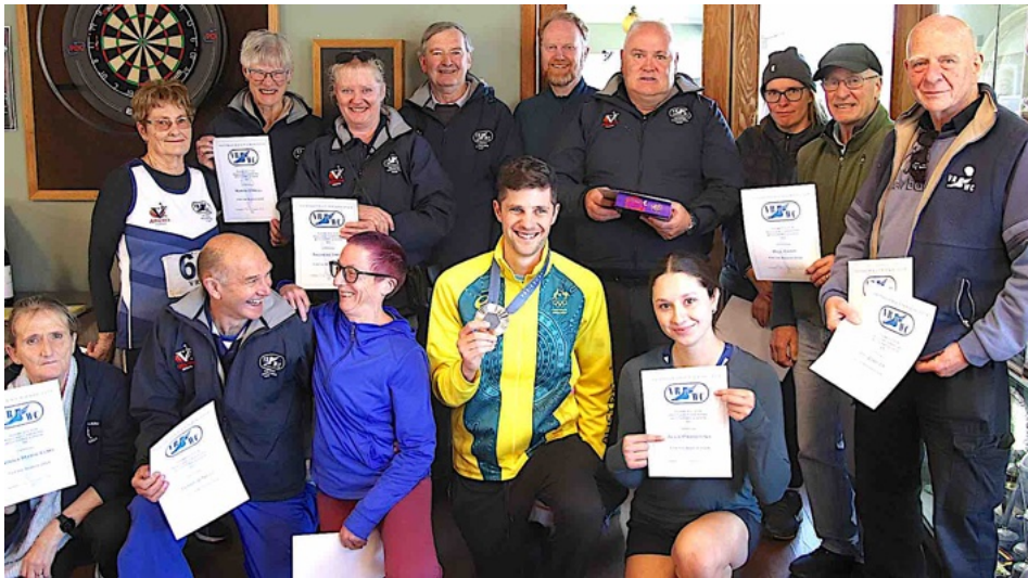
The engine room of any club ... Officials and helpers