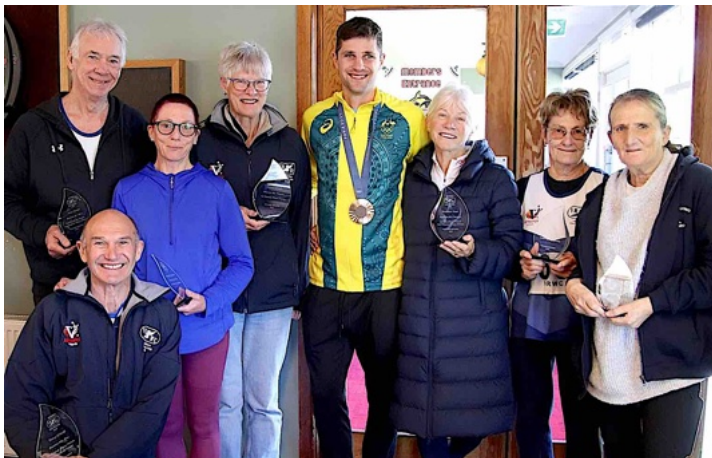
Masters 60+ Men & Women