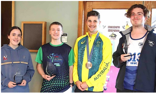
U16 Boys & Girls