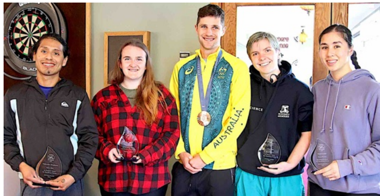
Open Men & Women