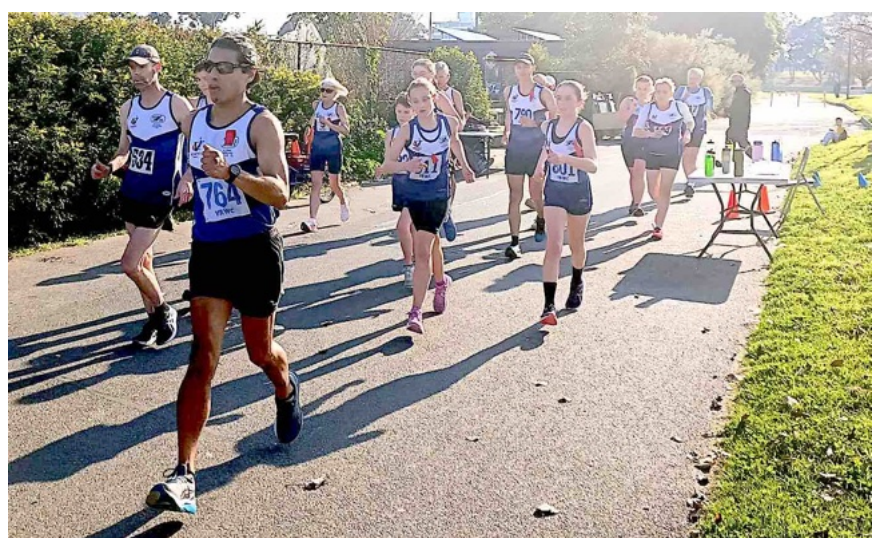
The hardy ones set out on another 2km interval.

Pace judgement is the key in these races. As with interval workouts in training, spreading one's reserves evenly over all repetitions while having enough left for a strong finish is a challenging skill, not least in this case because it's still a race and one still wants to beat as many of the opposition as possible. For walkers of all ages it's a learning experience, even for those well-practiced at it. Anyone can fall for the trap of blasting the first interval at warp speed, only to realise with horror that they have to face later reps with an almost empty tank. That didn't seem to happen here.