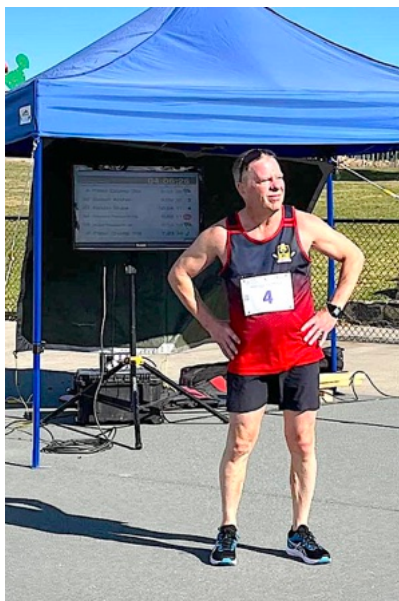
35km ... plus another 5km. "Is that it? Can I go home now?"