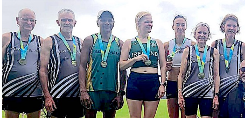
Boy, that was hard-earned bling!