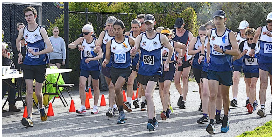
The 'big kids' get down to it!

Club points results, 1 June – Middle Park