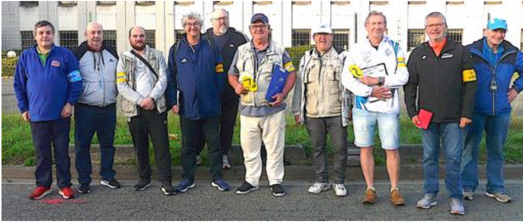
Watch yourselves, you bouncy lot!