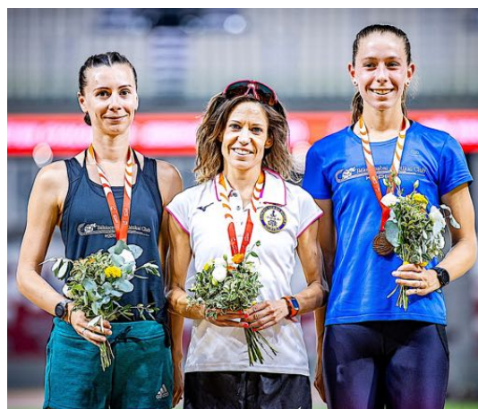
... and later, smiles on the podium.