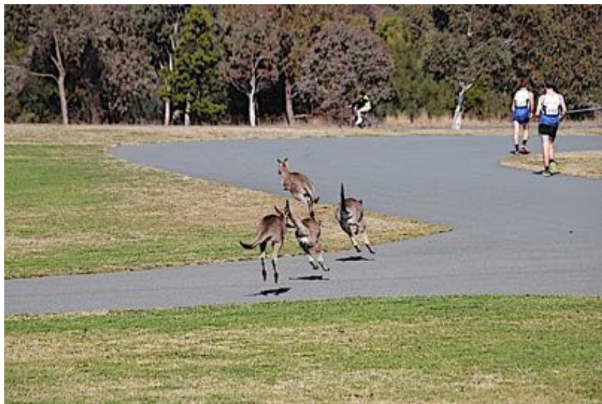
Try to stay up with the Vics, you'll soon roo your mistake ...