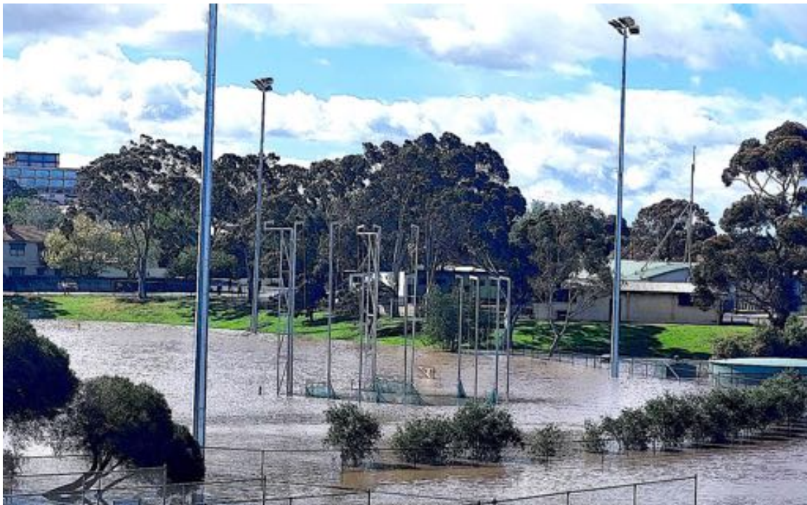
The same scene, three days later.