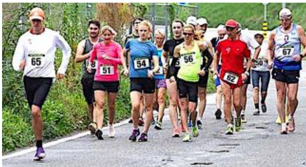
Start of the Hill race ... the easy bit.