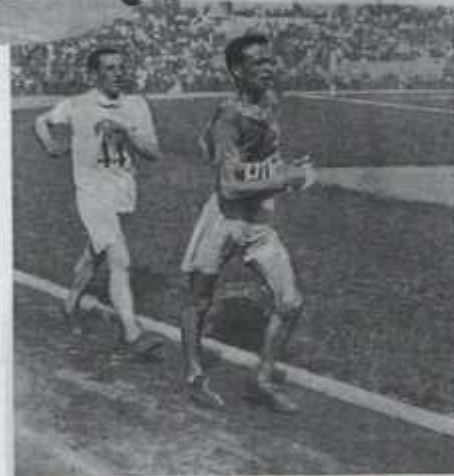
Reg walking to a silver medal behind the winner Ugo Frigerio, of Italy, in the final of the 10,000m at the Paris Olympics, 13 th July 1924.