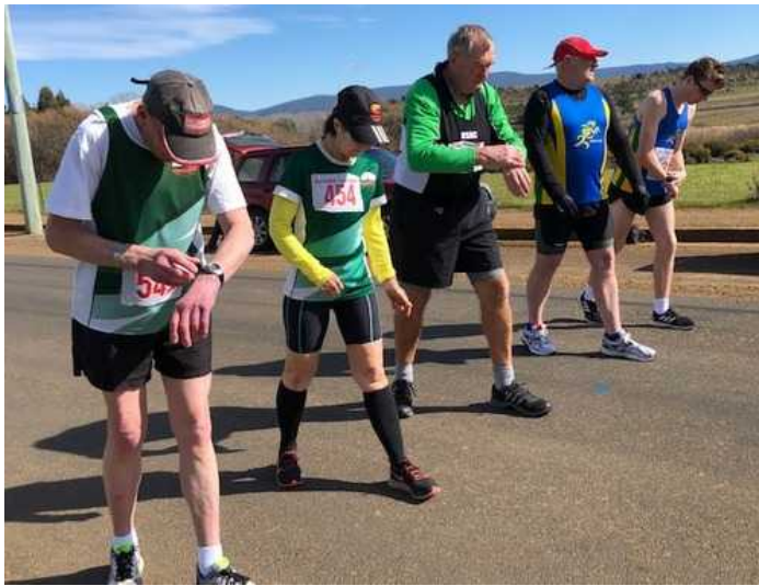
Left: The 5km walkers get underway