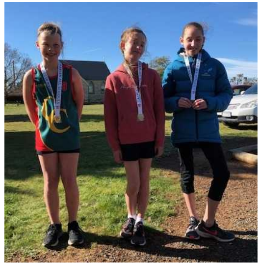
Right: some of the youngsters