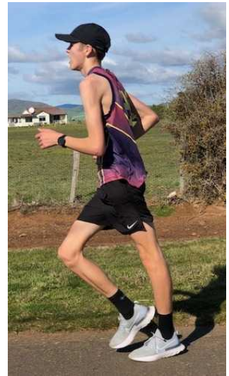
More action from Saturday