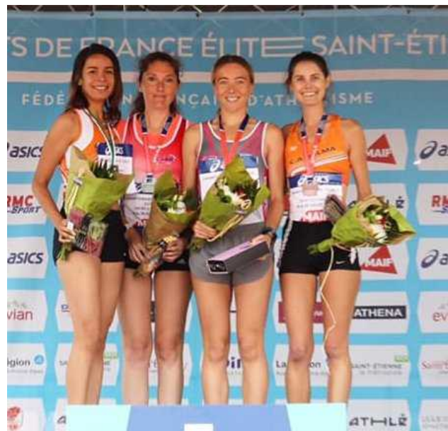
The women's podium