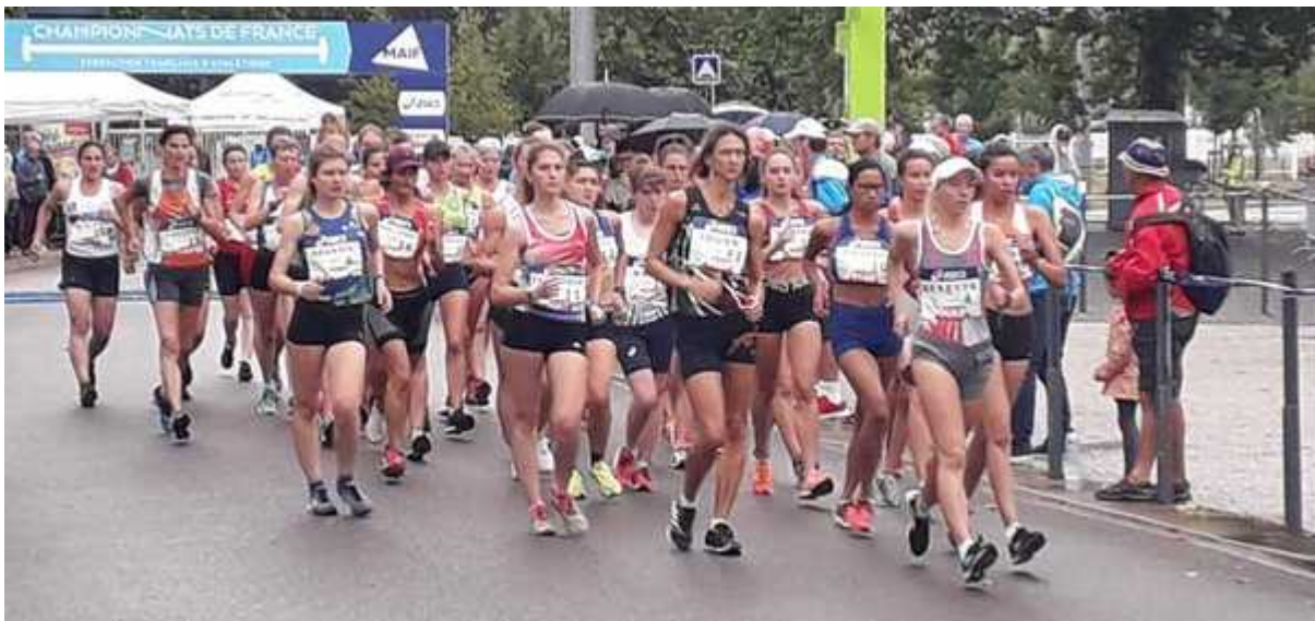
Start of the women's championship racewalk