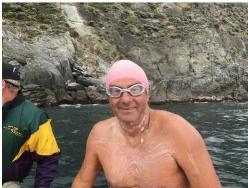
February 2017 – greased up and ready to swim the Cook Strait

Cook Strait is 26km in a straight line...although I covered a lot more distance thanks to the strong tide. The main challenge at Cook Strait is that it's such a volatile body of water and the tides only offer a very short window of opportunity to reach the finish.