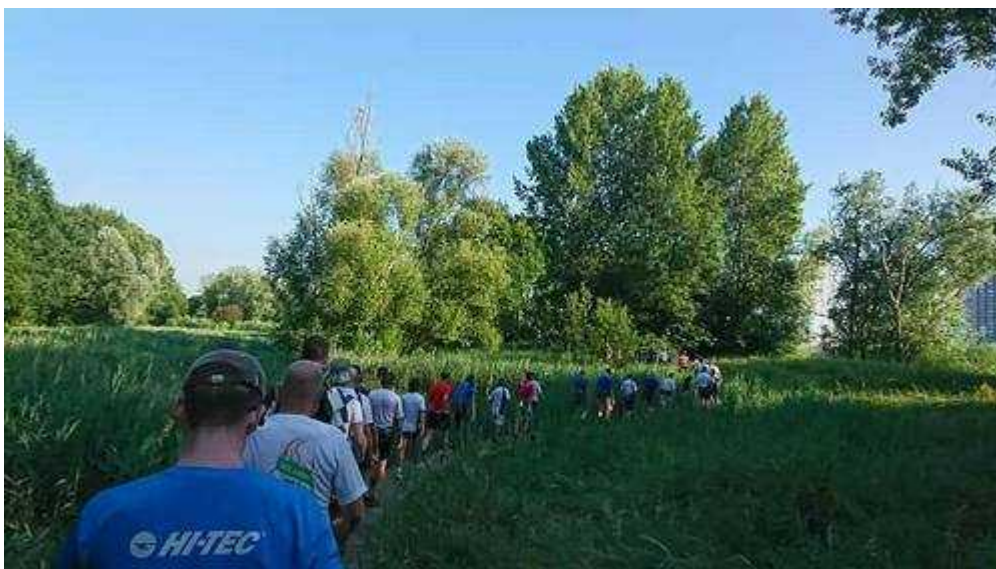
Walkers in action in the RWV 90 th Anniversary walk from Vlissingen-Rotterdam

Total distance 160km. From reading the comments of the various participants, it was a great success. See the event report at http://www.rotterdamsewandelsportvereniging.nl/index.php?mact=News.cntnt01_detail,0&cntnt01articleid=115&cntnt01origid=15&cntnt01returnid=133 .