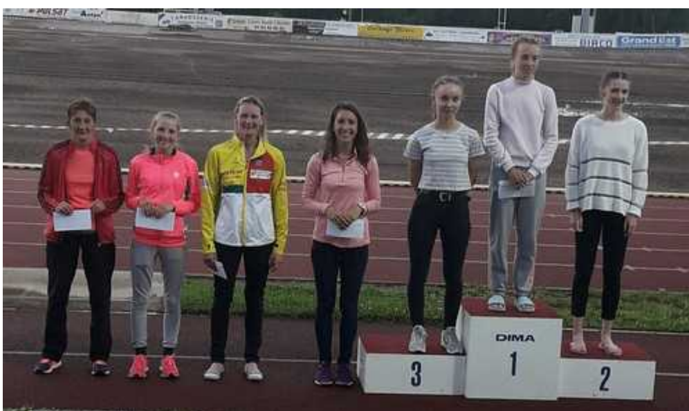
Podium at Lunaville