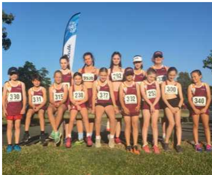
Some of the young Queensland walkers in their QRWC uniform on Sunday