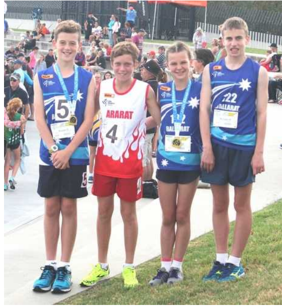
The young walkers from the Ballarat Little Athletics Centre also did well in the LAVic titles