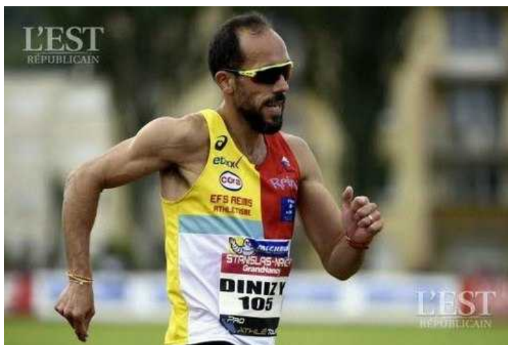
Johann Diniz in action in Nancy