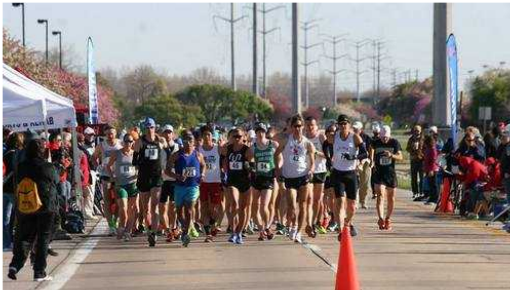
The big field gets underway in the USA Teams Championships Trial