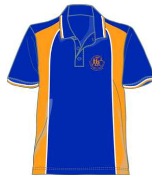
The LBG 50 th Memorabilia -on sale now!