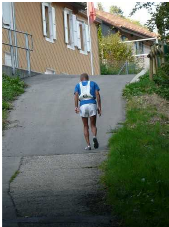
The hill each lap – no wonder not too many walkers turned out!