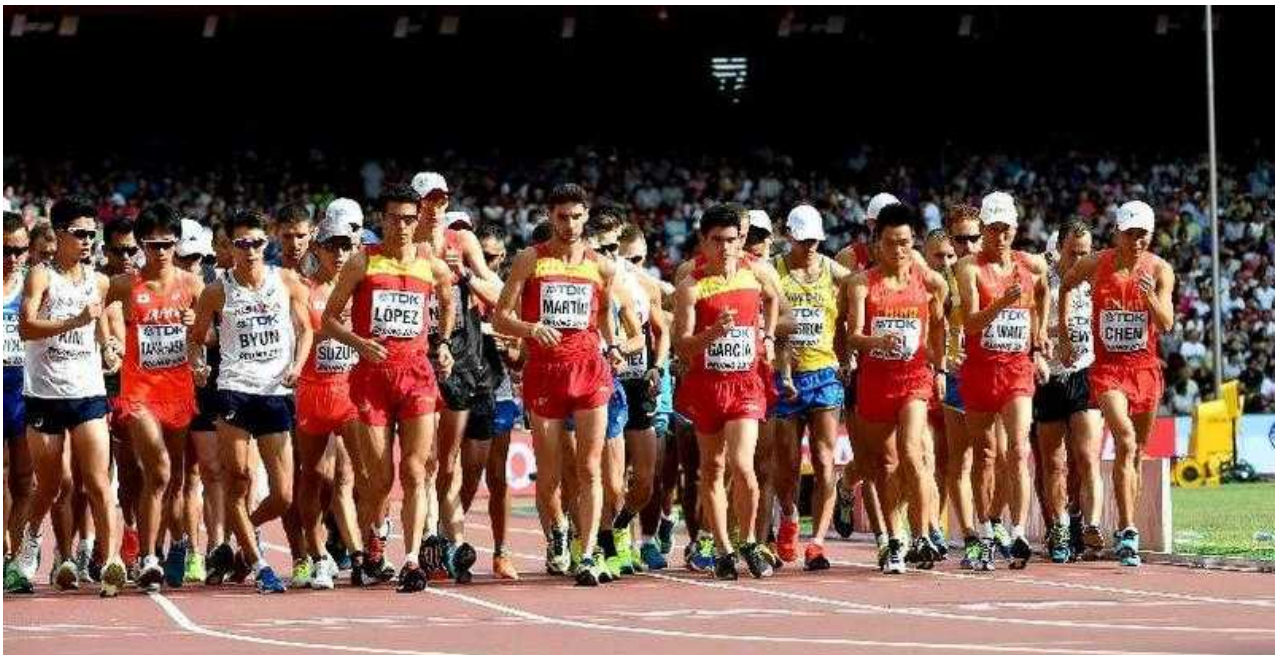
The start in the Birdcage