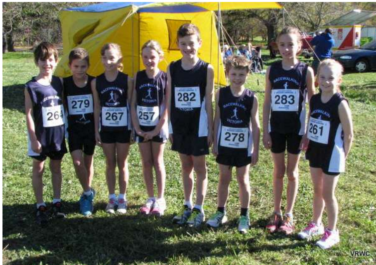
The gold medal winning RWV U10 Boys and Girls teams