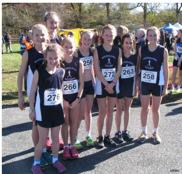
Team golds to the RWV U14 Girls Team