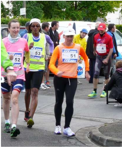
Left: The first 3 women