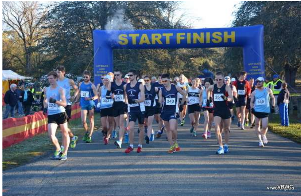
Right: The start of the long events around the lake