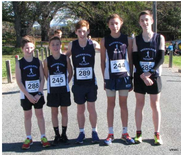
More gold to the RWV U16 Boys Team