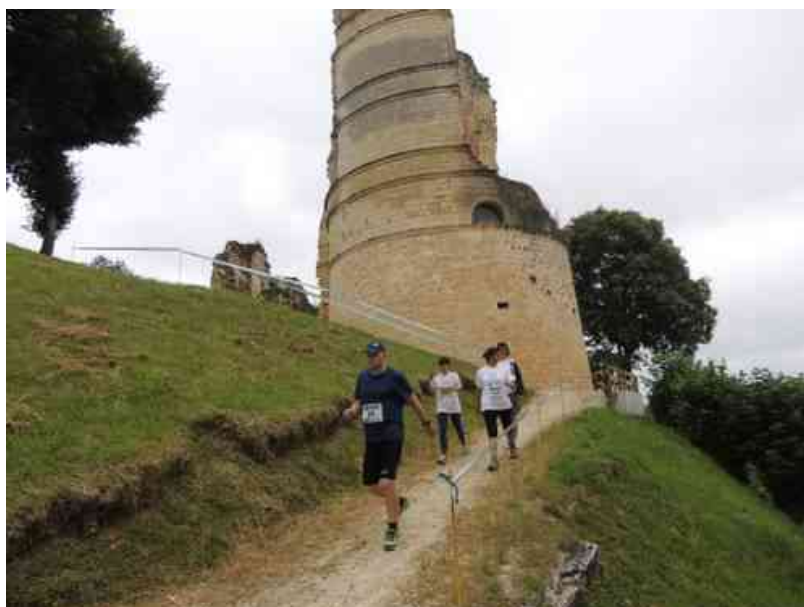
Part of the course at Montguyon - not your typical flat fast lap!

Check the website for the full results and for plenty of photos: http://asso.lempreinte.free.fr/index.php?page=classements-3 . Check out this photo!