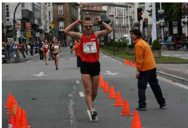
Ines Henriques and Jared Tallent win their races in La Coruna last Saturday