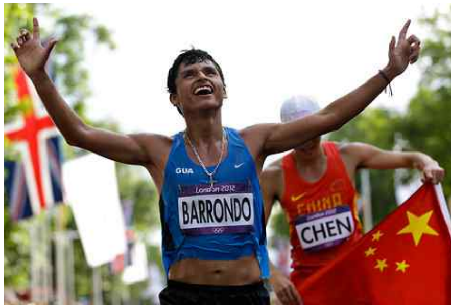
Chen and Barrondo celebrate their medal winning races