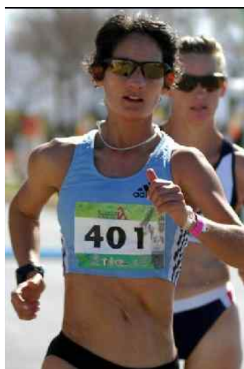
Inés Henriques leads women's 20km