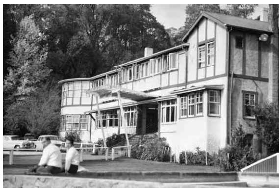
The Woodstock Guesthouse in Healesville, the scene of the yearly trip