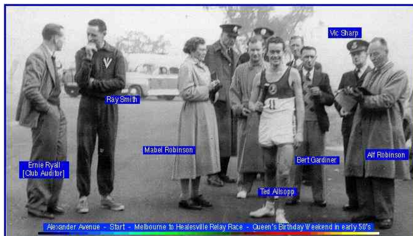
Alexander Avenue - Start - Melbourne to Healesville Relay Race - Queen's Birthday Weekend in early 50's